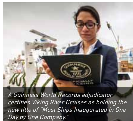
A Guinness World Records adjudicator certifies Viking River Cruises as holding the new title of "Most Ships Inaugurated in One Day by One Company."