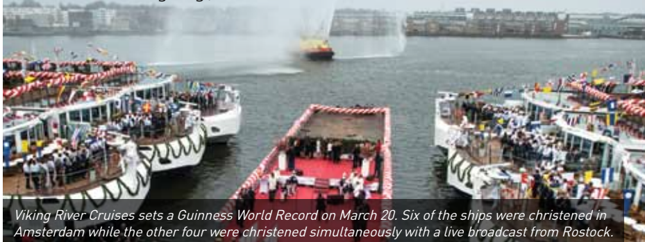
Viking River Cruises sets a Guinness World Record on March 20. Six of the ships were christened in Amsterdam while the other four were christened simultaneously with a live broadcast from Rostock.

Comfortable and stress-free, river cruising offers a fabulous variety of destinations to explore. Little wonder so many people have fallen in love with this relaxing, immersive and enjoyable way to travel.