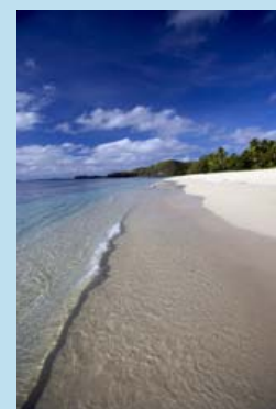
Your own beach