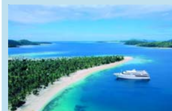
Cruising Blue Lagoon